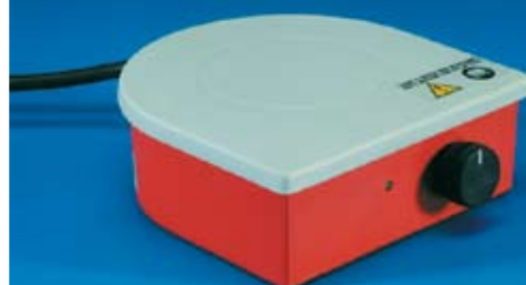
Magnetic Stirrer (Model TKO) art. 2228